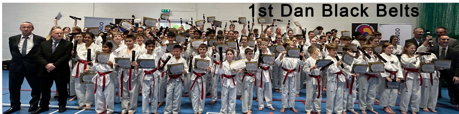
1st Dan Black Belts