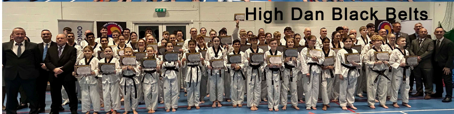
High Dan Black Belts

Gaining your Black Belt in Taekwondo is everybody's aim! It is a long challenging journey and many give up and quit along the journey. It takes resolve and determination and is an incredibly character defining experience. The 2025 national level Winter Dan Grading Black Belt Examinations were hosted in Nottingham on Sunday 23rd November by